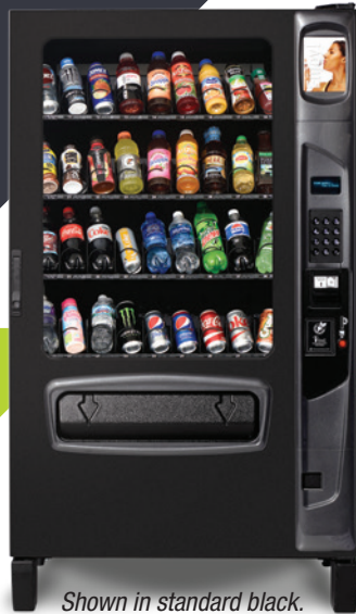
Shown in standard black.