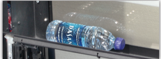
Elevator Gently Delivers a Wide Range of Beverage & Dairy Products