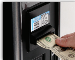
Premium Currency Acceptors

Includes standard electronic coin acceptor and $1, $5, $10 & $20 bill acceptor (Set for $1 & $5)